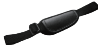
Hand strap (x1)