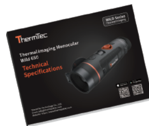
User manual (x1)