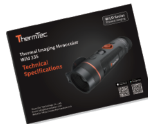
User manual (x1)